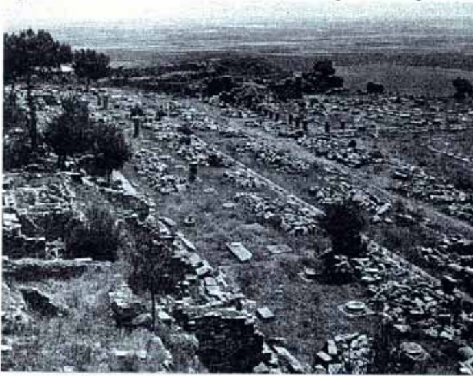
Figure 1.1 The ruins of Priene

Whilst it is true that advances in solar science and technology are accelerating and becoming more widely publicised, (especially in the area of solar electricity generation) the origins of solar technology stretch back into ancient history, as exemplified by the astounding solar city of Priene, built by Greek colonists 2500 years ago on the southern slopes of Mount Mycale in what is now modern day Turkey.